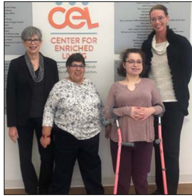
SUPPORT INDIVIDUALS WITH DISABILITIES