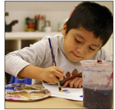
ENHANCE ARTISTIC EXPERIENCES