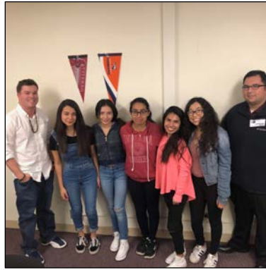
DEVELOP SKILLS IN TEENS