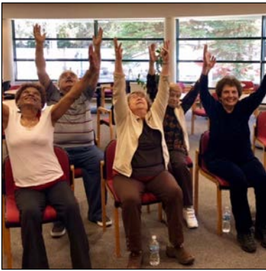
ASSIST OLDER ADULTS